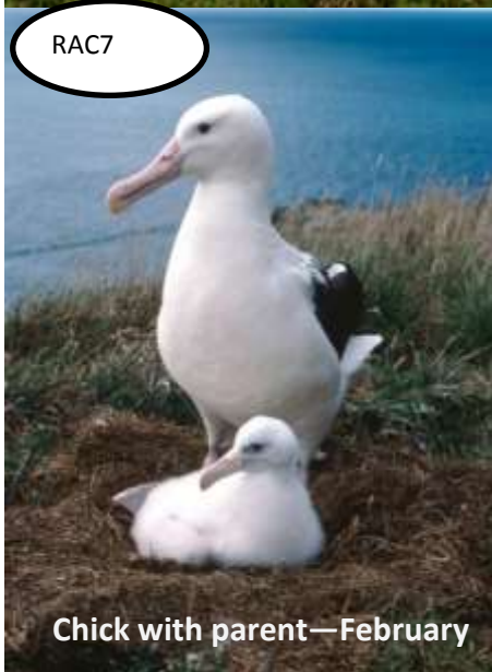
Chick with parent—February