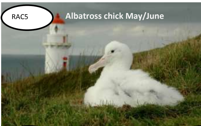
Albatross chick May/June