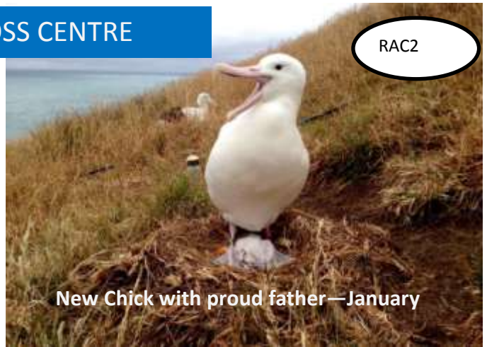
New Chick with proud father—January