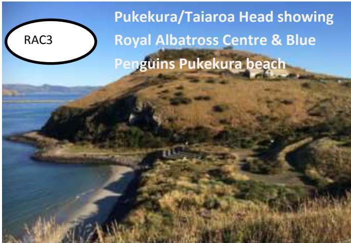
Pukekura/Taiaroa Head showing Royal Albatross Centre & Blue Penguins Pukekura beach