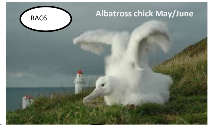
Albatross chick May/June