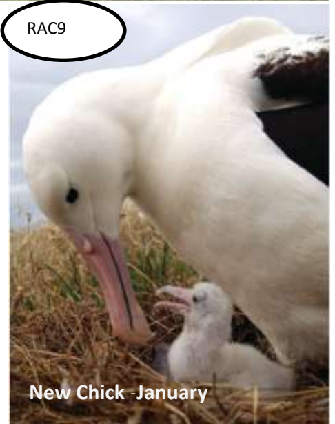
New Chick - January