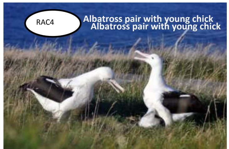
Albatross pair with young chick Albatross pair with young chick