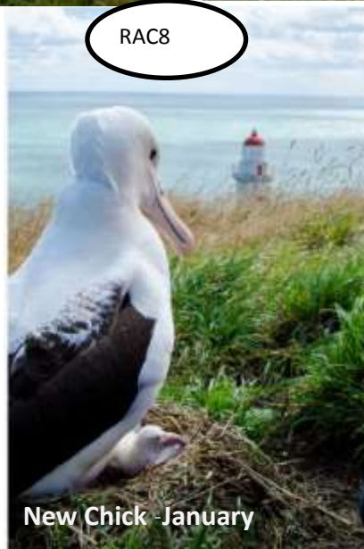
New Chick - January