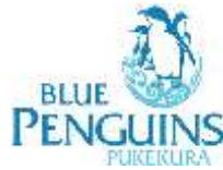
Blue Penguins Pukekura at Pilots Beach